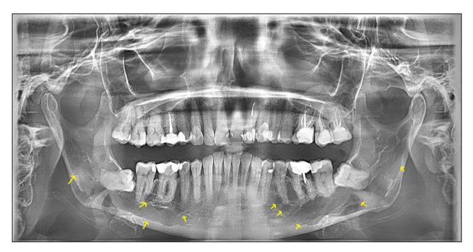
Figure 2. Case Report 2. Panoramic radiograph showing radiolucencies in the bone structure of both ramus and the body of the mandible, in the areas of mandibular premolars and molars

thoracic vertebral column. The patient was resistant to firstline chemiotherapy (VTD), and as the second-line received ixazomib-Rd. Laboratory test showed a decreased level of haemoglobin (Hb 8.6g/dL). The patient was referred for facial CT scan. The examination revealed multiple scattered osteolytic lesions within the bony structures of the craniofacial bones and base of the skull, jaw, and cervical vertebrae. The patient reported for oral cavity treatment. The dental surgeon referred the patient to the Department of Radiodiagnostics of the Medical University in Lublin for panoramic X-ray and CBCT. These examinations confirmed the presence of well-defined large multiple radiolucencies without sclerotic rim located in the both ramus and the body of the mandible, in the areas of mandibular premolars and molars [Fig. 2].